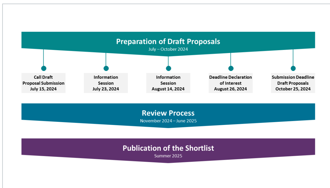
Figure 2: Process Schedule

During the review process, written queries regarding to the draft proposal may be sent to submitting parties. These queries are expected to be presented in a bundle to the submitting parties in March 2025. The submitting parties are therefore asked to name a contact person for these queries and to ensure their availability in March. The deadline for replies is presumed to be two weeks.